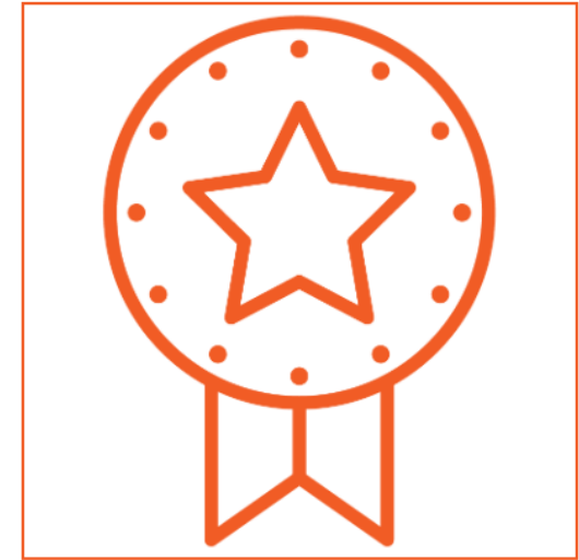
Quality and Service Delivery