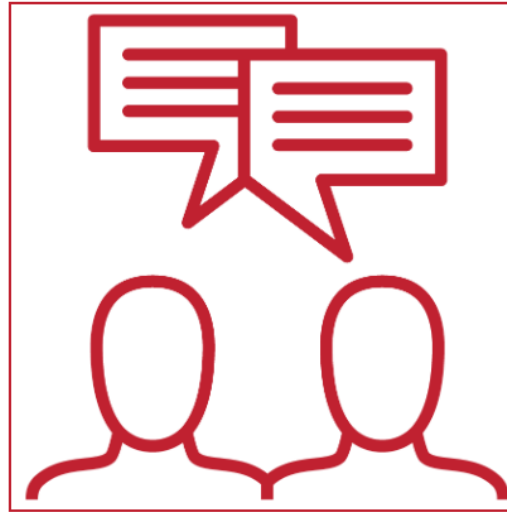
Technical Assistance and Training