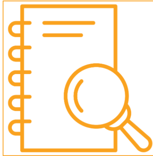
Policy and Research